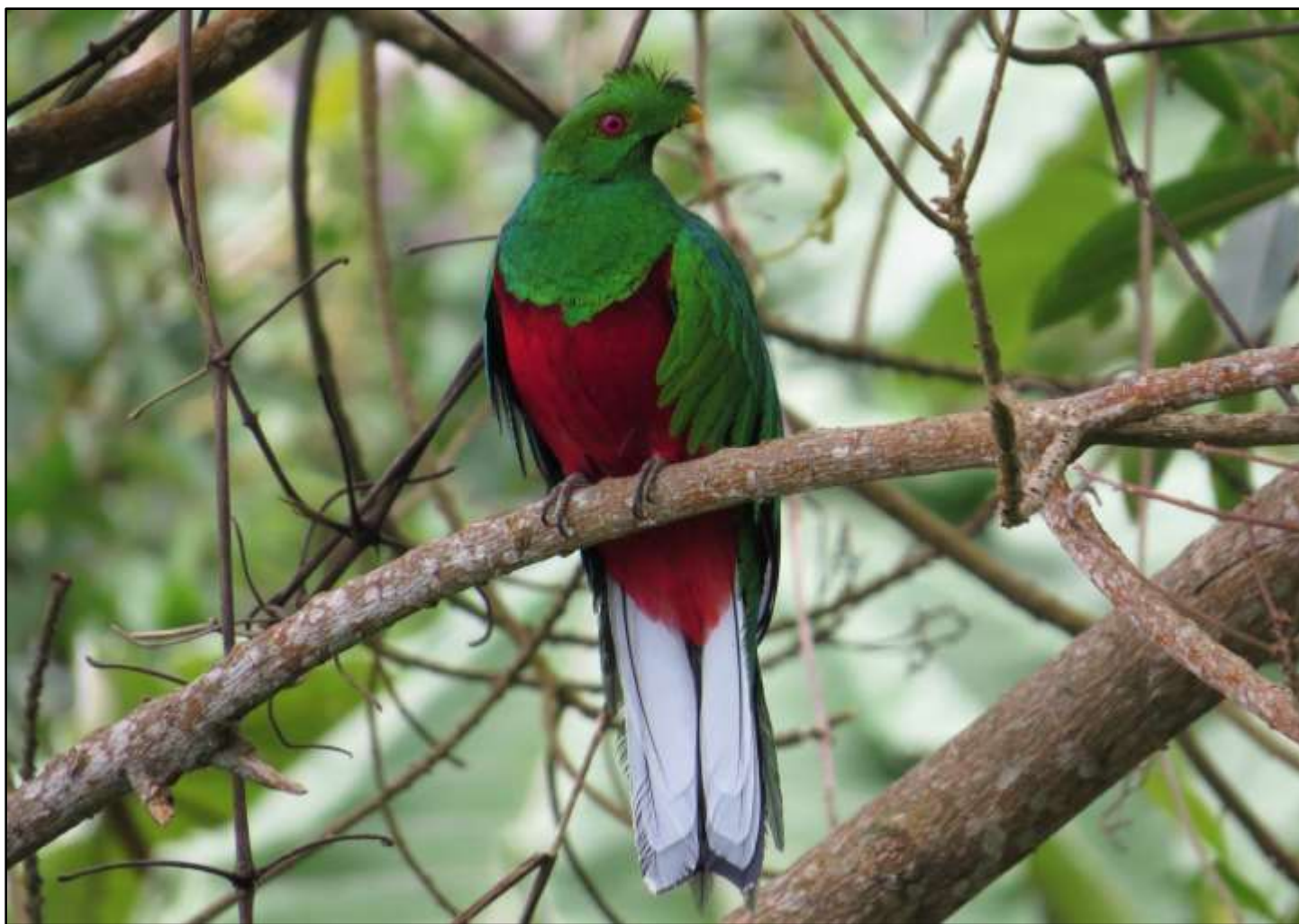
▲ Crested Quetzal Trevor Ellery