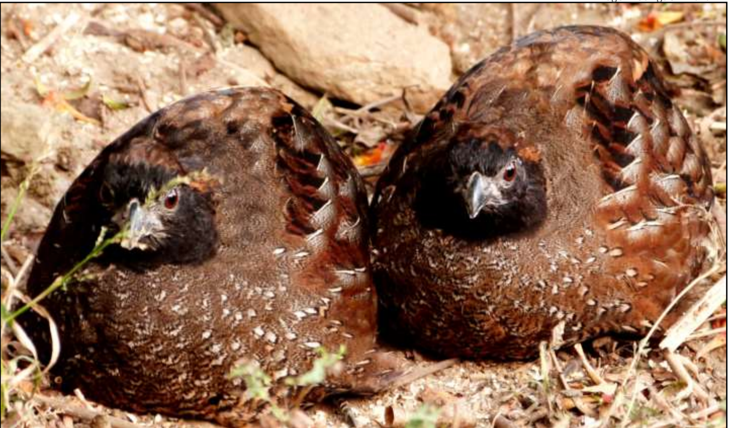
▼ Black-fronted Wood Quail Roger Rodriguez Ardila