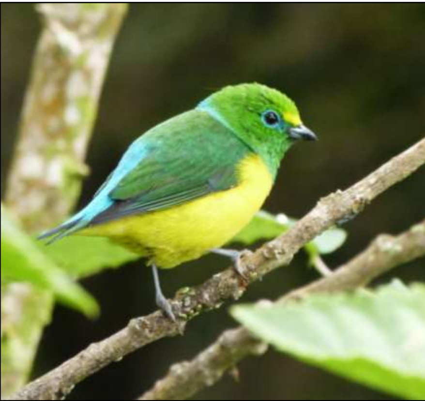
▲ Blue-naped Chlorophonia