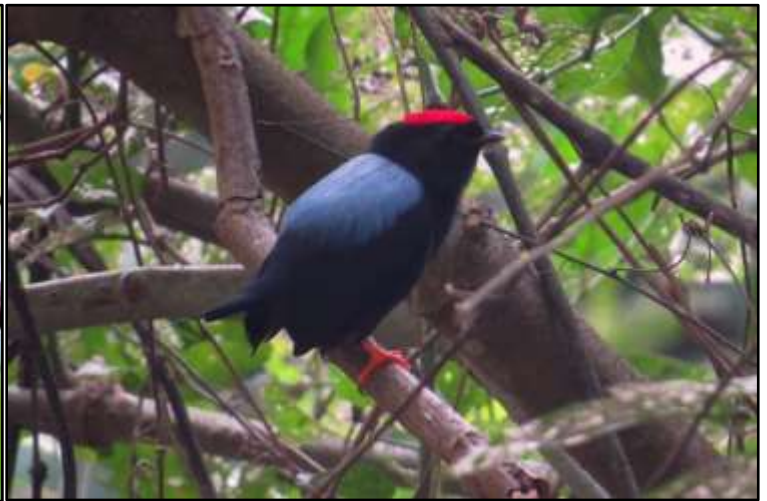
▲ Lance-tailed Manakin Trevor Ellery

The Serrania de Perija is an isolated offshoot of the Eastern Andes that forms the border with Venezuela and is one of the least explored areas in Colombia. The Perija Thistletail Reserve is located in the villages of El Cinco and Altos de Perijá, in the municipality of Manaure, department of Cesar, and protects a huge portion of the remnants of high andean forests, subparamo and paramo of this area.