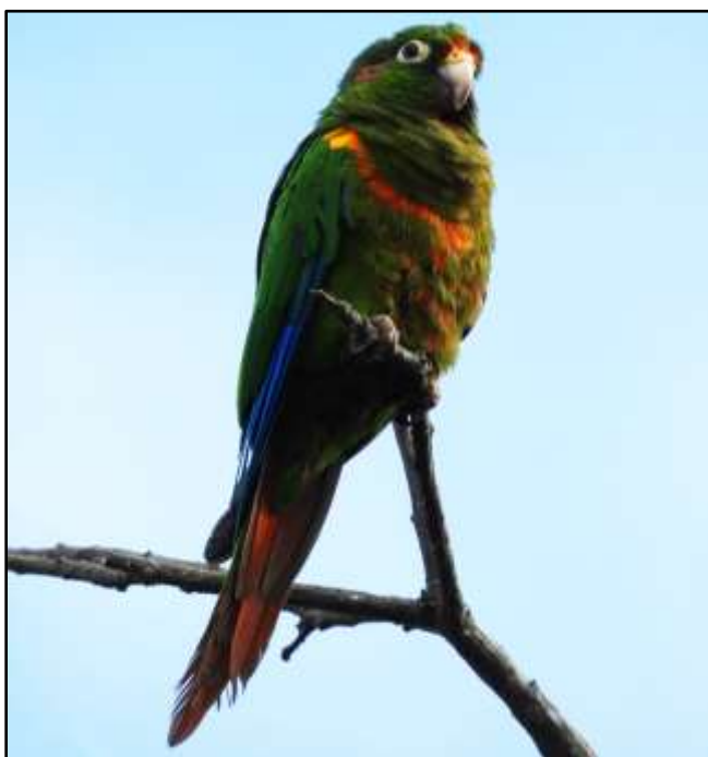
► Santa Marta Parakeet