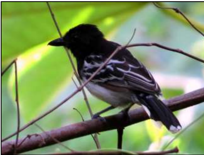
▲ Black-backed Antshrike Trevor Ellery

Accommodation at Perija Thistletail Bird Reserve.